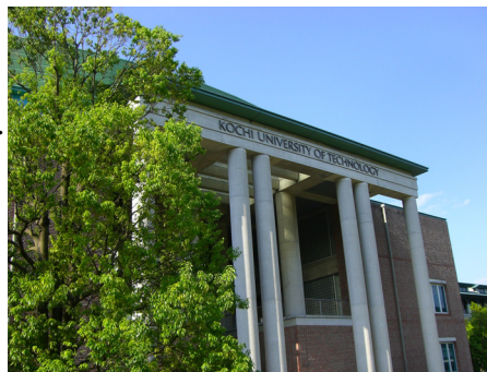
Kochi university of technology

One of the primary functions of the chapter is to provide an educational forum to (1) educate young researchers, (2) exchange up-to-date information, and (3) establish new collaborations across different engineering fields exploring "Instruments" and "Controls". For this purpose, we will hold brand-new symposium in this autumn.